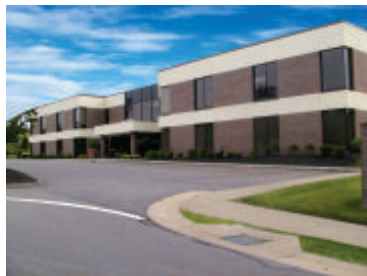
Office at Rochester

“NetSmartz did a very good job for us. They deliver what they promise and they are always on time. We ran into a few hang-ups on the project. But they did a great job of correcting all problems to our complete satisfaction. Very professional.”